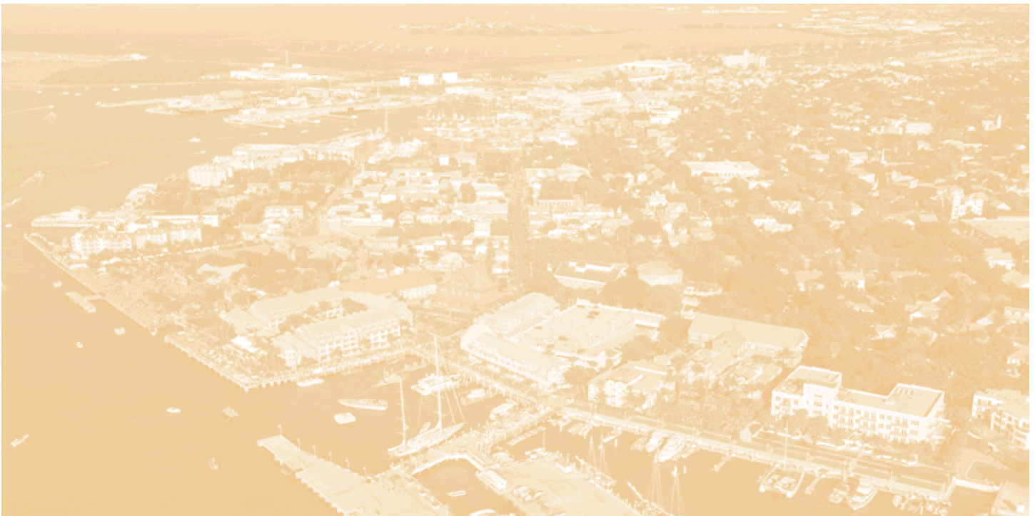
Aerial photo of Key West, Fla.